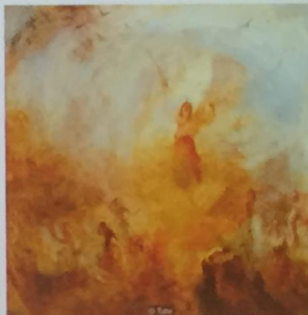
JMW Turner, The Angel Standing in the Sun (1846), Tate Britain (N00550)