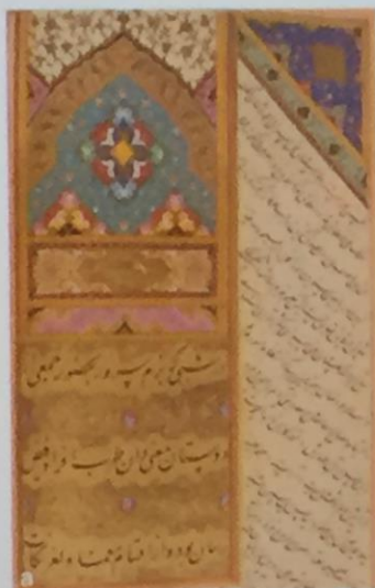
Iranian manuscript of a compendium of knowledge (jung), made for shah sulayman (17 th c) Harvard Art Museums (1984.463)