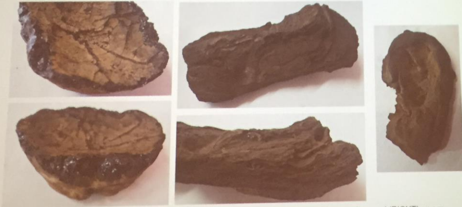
Fig. 2. Photographs of (LEFT top and bottom) skull endocast, (CENTRE top and bottom) textile wrappings and (RIGHT) an ear.